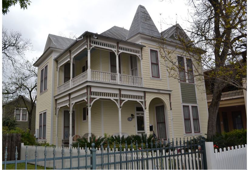
PHOTO OF 310 ADAMS NOW