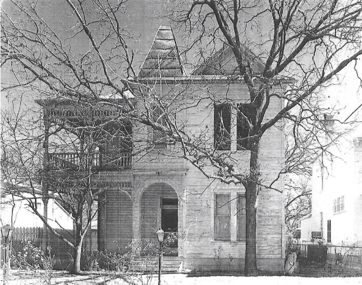
PHOTO OF 310 ADAMS THEN