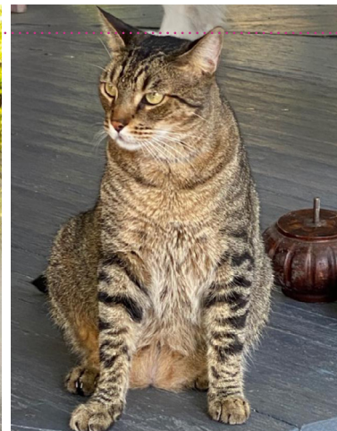
FRED THE GREAT WHITE PYRENEES AND KIT KAT THE RESCUED TABBY

shops, and or museums in and around King William. I hope to highlight the many people that take part in creating a community filled with old world charm, a rich history, and unique art. I hope to meet residents who have lived here for generations as well as those who have discovered just how special it is to have a home in a historical part of the most beautiful city in America. Please email me if you would like to nominate a place, a person, or a pet for future issues. cindy66miller@yahoo.com