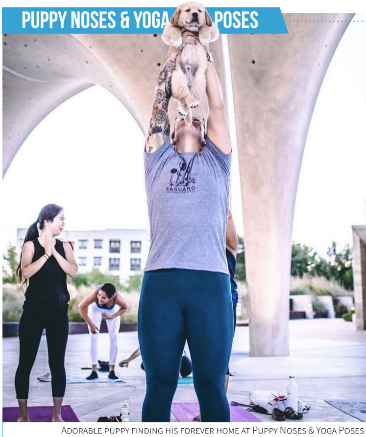
ADORABLE PUPPY FINDING HIS FOREVER HOME AT PUPPY NOSES & YOGA POSES