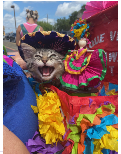
LEFT TO RIGHT: CALVIN, THE 2021 4 PAWS FIESTA KING, JAMMING OUT ON HIS BONGOS WITH HIS MOM AND SISTER IN TOW; JASMINE, THE 2021 4 PAWS FIESTA QUEEN, WAITING ON HER MOM'S LAP FOR THE CONTEST TO BEGIN; A FURRY CONTESTANT AND HIS MOM ENTERING THE JUDGES' TENT TO SHOW OFF HIS FIESTA DUDS; A KITTEN IN HER SHOEBOX FLOAT WARMING UP HER VOCAL CHORDS BEFORE THE SHOW.